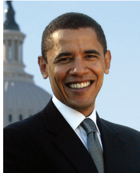
Barack Obama Democrat